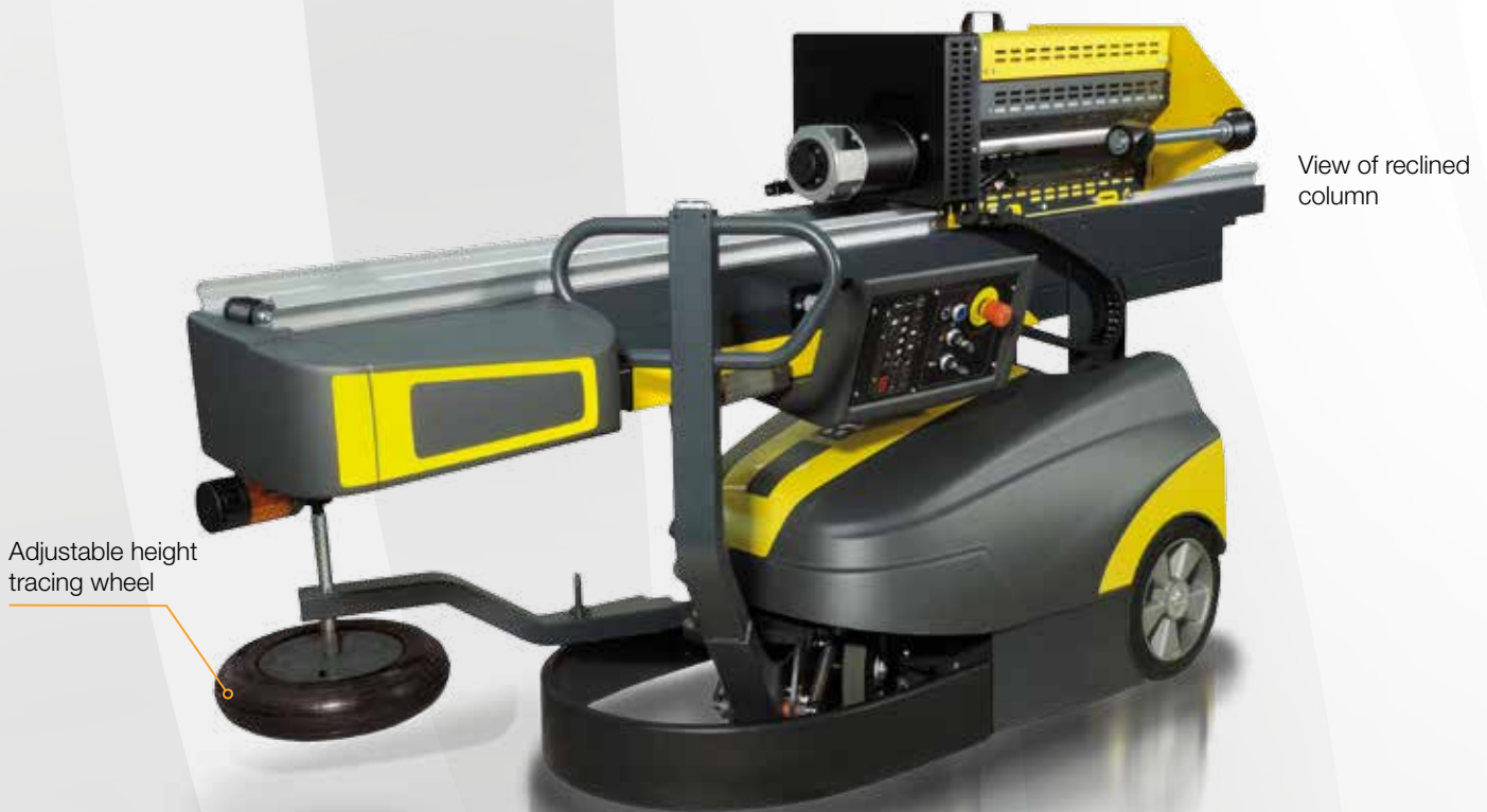
Adjustable height tracing wheel